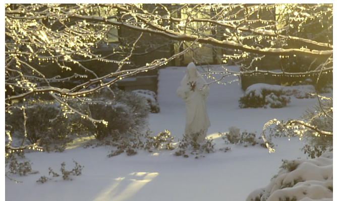
Garden of Joy & Happiness after snow & ice storm