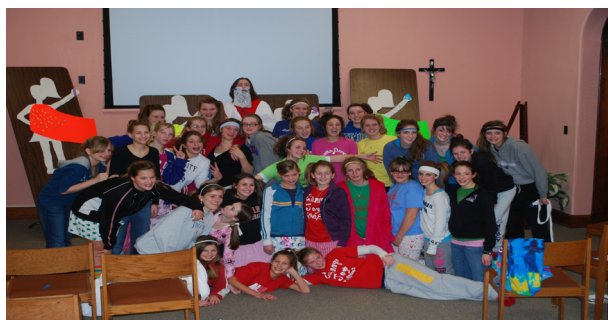
Young retreatants striking a pose

Call Linda Tracy at 513.351.9800 ext. 305 for more information or a brochure.